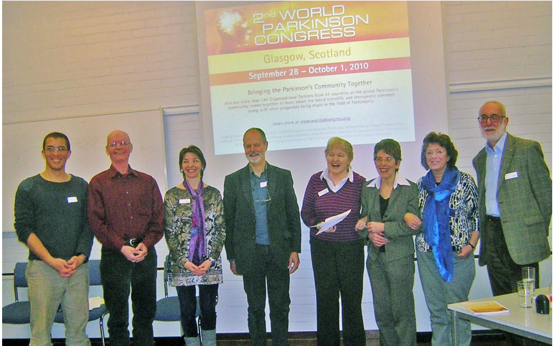
Parkinson's UK Edinburgh Branch