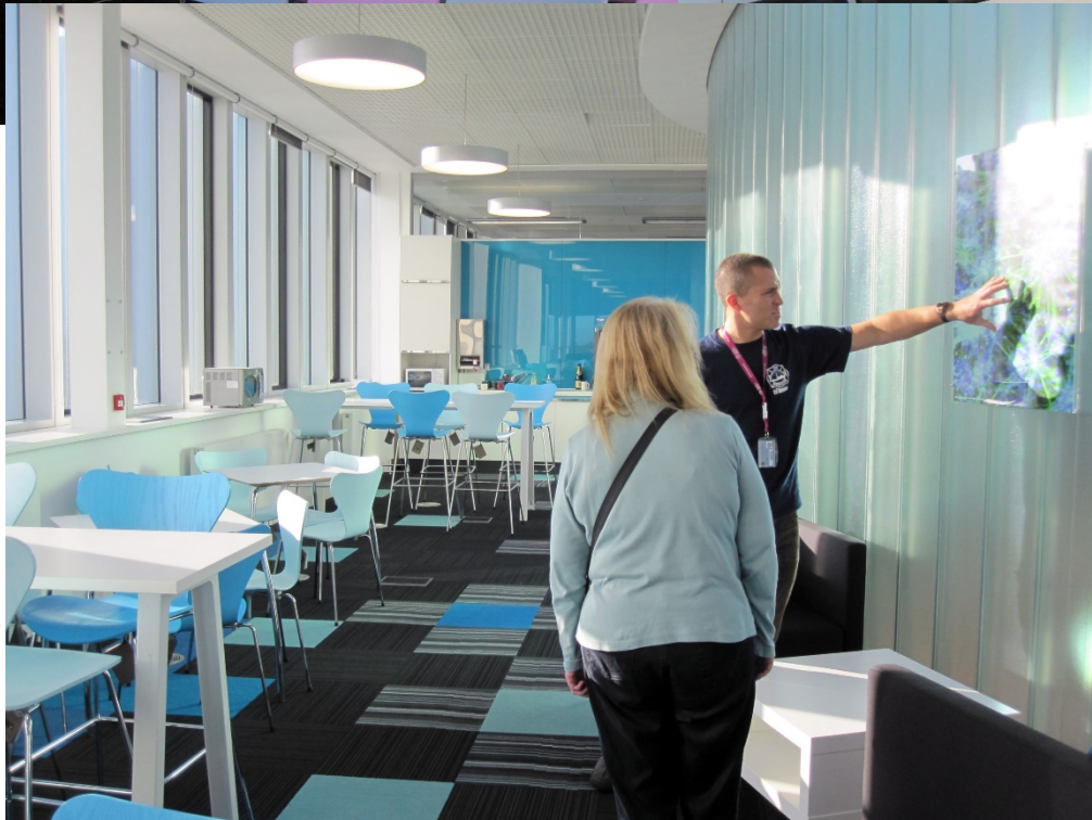
Parkinson's UK Edinburgh Branch

PARKINSON'S UK CHANGE ATTITUDES. FIND A CURE. JOIN US.